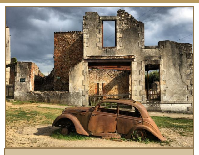
<u>Historical Sites:</u> Visit Oradoursur- Glane and discover its story (15 min.)

Porcelain: Museums, factories and shops are all at our doorstep (10min.)