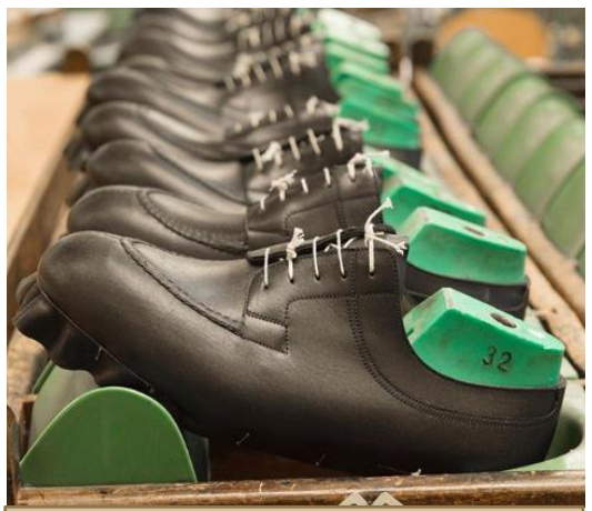
<u> Craftsmanship: </u> Leather and glove-making factories (25min.)